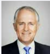
Malcolm Turnbull Non-executive Director