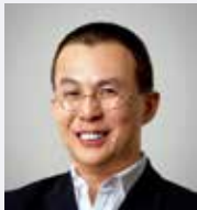
Richard Li Chairman