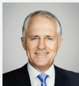
Malcolm Turnbull Non-executive Director