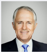
Malcolm Turnbull Non-executive Director