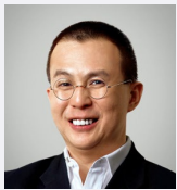
Richard Li Chairman