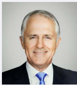
Malcolm Turnbull Non-executive Director