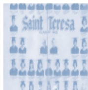
125 Years of History

The Virtual Ministry E-Kit is a resource for parishioners who are unable to attend Mass in person. It includes a variety of prayer resources, including a virtual Mass and a virtual Stations of the Cross.