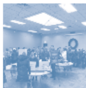
Virtual Ministry E-Kit

The St. Teresa of Avila parish women's group is a vibrant and active group of women who meet regularly for prayer, support, and fellowship. They are currently planning a retreat for the summer months.