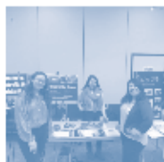
2018 Faith in Action Grant