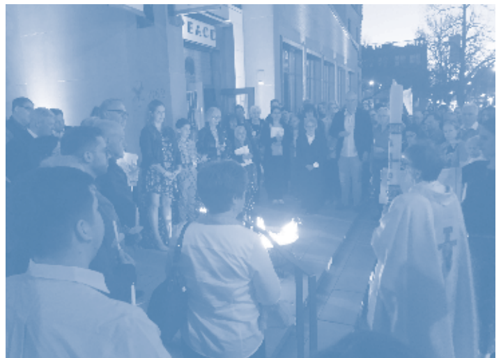
The Easter Fire is lit at the beginning of the Easter Vigil.

All groups must be registered by Friday, September 20.