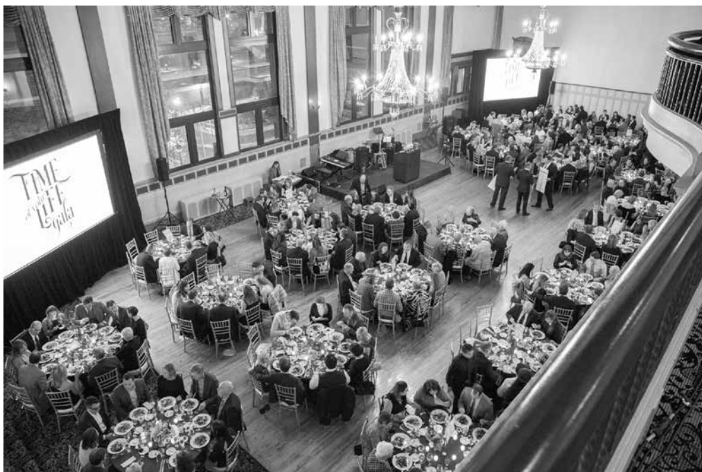
2018 Time of Your Life Gala