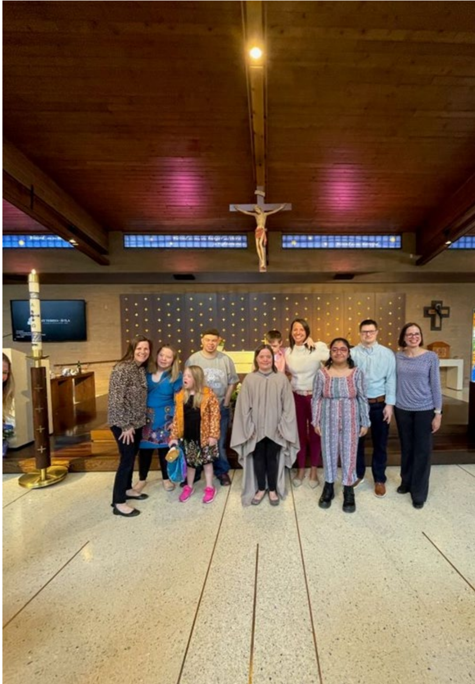
SPRED Mass April 30th, 2023