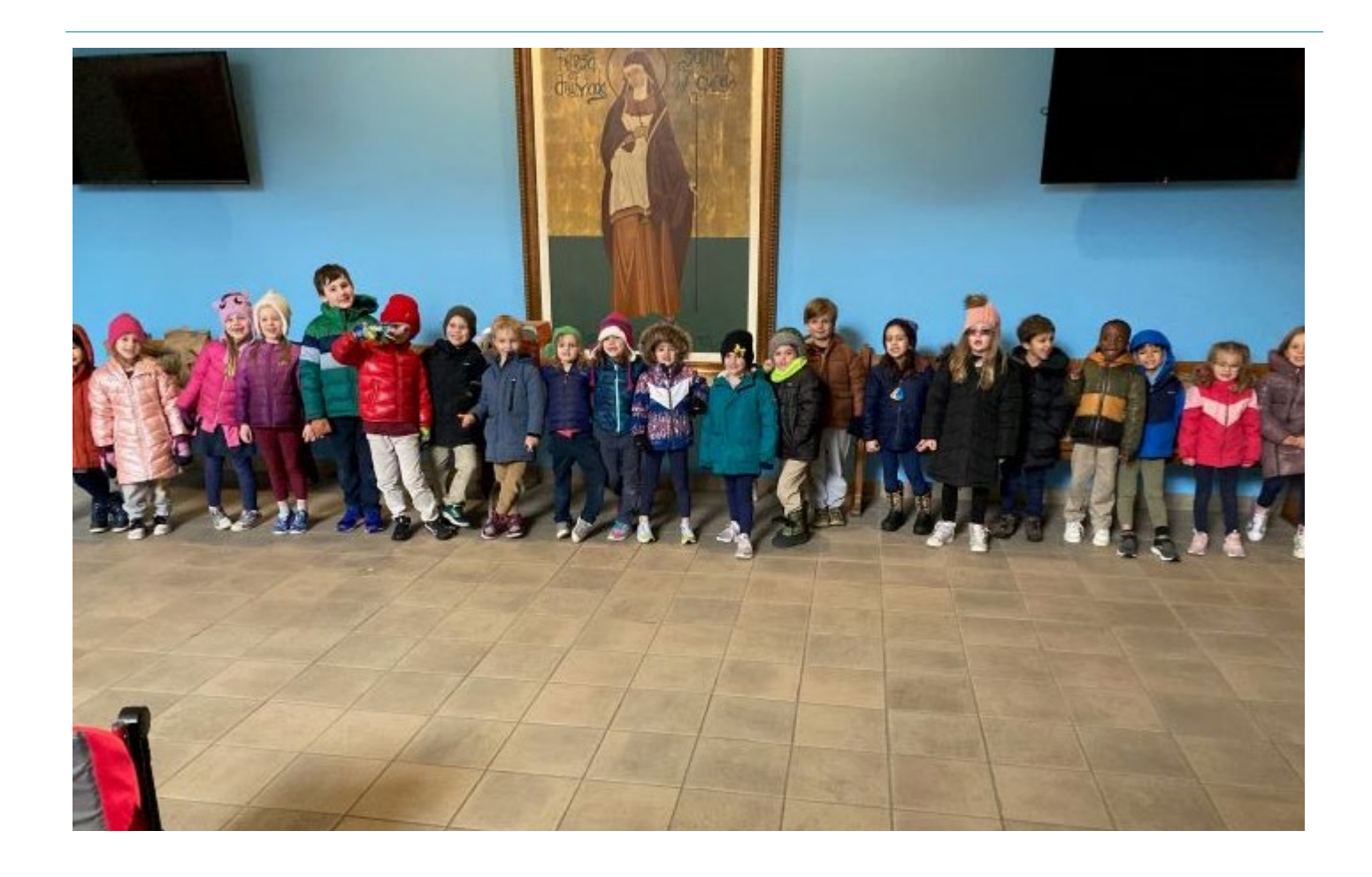
Our friends at St. James Lutheran School

St. James provides bag lunches once a month to Loaves and Fishes so that we can provide our guests with a warm meal to go and a sack lunch on these Friday's.