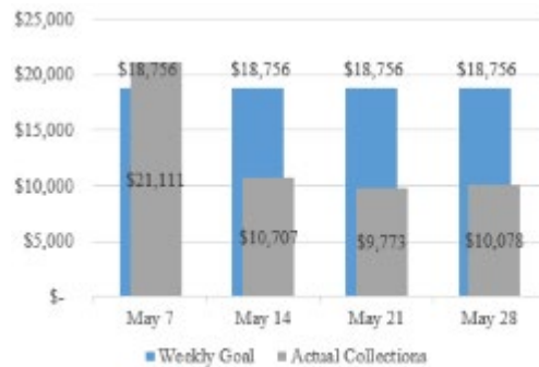
Actual Collections Vs. Weekly Budget