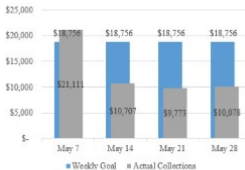
Actual Collections Vs. Weekly Budget