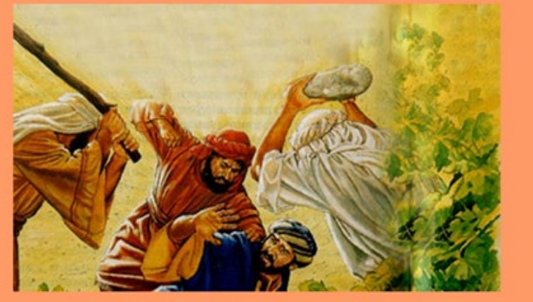
The Parable of the Wicked Tenants

Weekend Mass Schedule Saturday 6 PM French Mass Sunday 10 AM, 12 PM, 6 PM Daily Mass Schedule Wednesday - 8:00AM Friday Communion Service Friday- 8:00AM