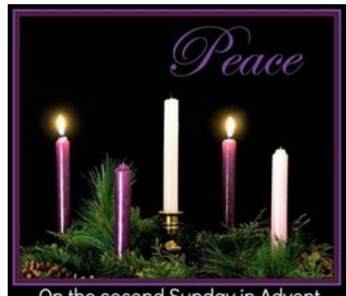
On the second Sunday in Advent the "Peace" candle is lit

The Second Week of Advent is the week of Peace. This verse tells us that Jesus came to be the Prince of Peace. The word peace is the Hebrew word shalom which means completeness or well being. Jesus did not come just to end wars, but to make us complete by saving us from our sinfulness.