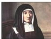
St. Louise de Marillac