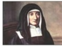
St. Louise de Marillac