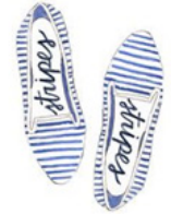
SHOW OFF YOUR STRIPES