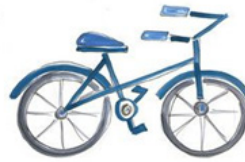
RIDE A BIKE FOR FUN