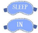
SLEEP UNTIL NOON