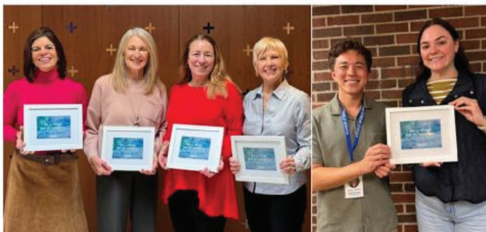
St. Vincent de Paul, St. Josaphat, St. Teresa of Avila, Immaculate Conception and St. Joseph

The LPOT parishes have been selected to receive The Heidi Moll Schoedel Open Arms Award in recognition of their faithful service and contributions to Exodus World Service's mission of welcoming and befriending refugees. Presented annually, this award honors outstanding service on behalf of refugees and is named in memory of Exodus World Service's late co-founder and former executive director. Through collecting care packs, mobilizing volunteers, serving at Heidi's House , raising awareness within the Christian community, and more; the LPOT parishes have made a lasting impact as dedicated refugee champions.