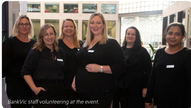
BankVic staff volunteering at the event.