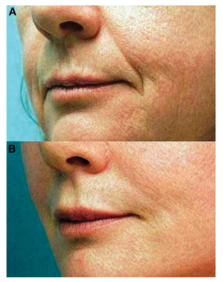
Figure 3. A: Preoperative photograph. B: One year after autologous fat grafting with PRP to nasolabial folds and lips.

Although the current results were based on qualitative, clinical findings, efforts are being set forth to further study the procedure from a quantitative, cellular level.