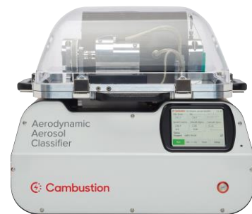
Figure 1: The AAC

The AAC principle is described in further detail here: http://www.cambustion.com/products/aac/animation