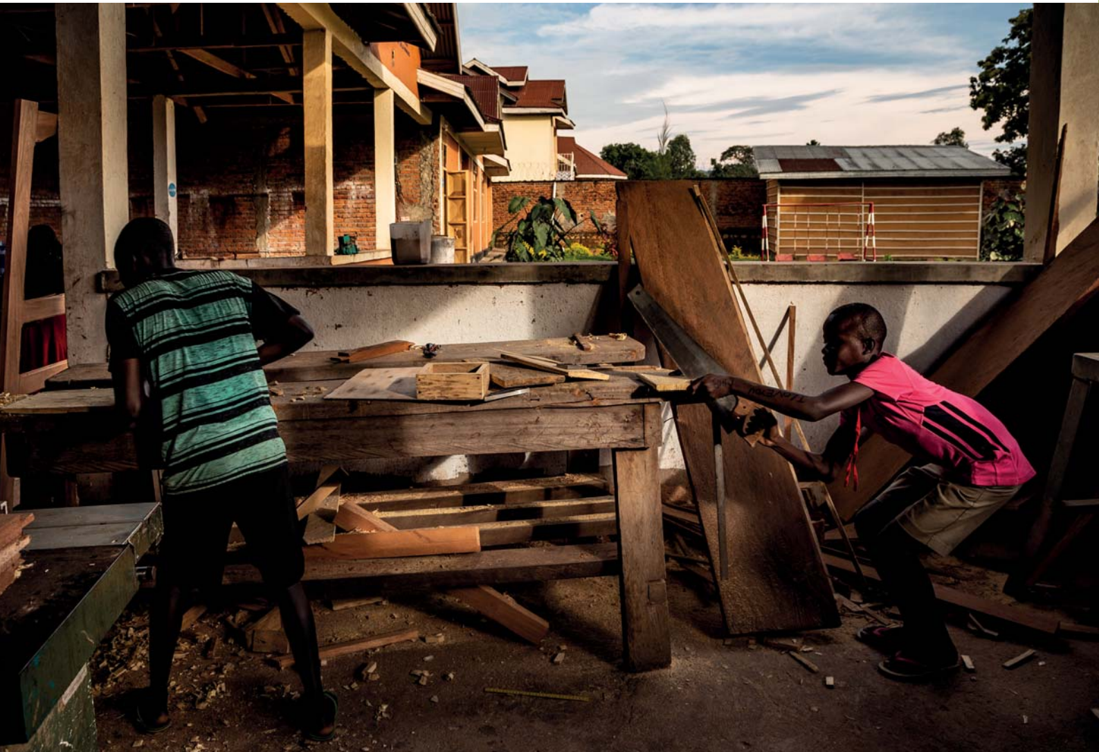
▲ Children at a rehabilitation centre in Bunia, Ituri province. ▼ Carpentry and other vocational skills help former child fighters and separated children return to normal life.