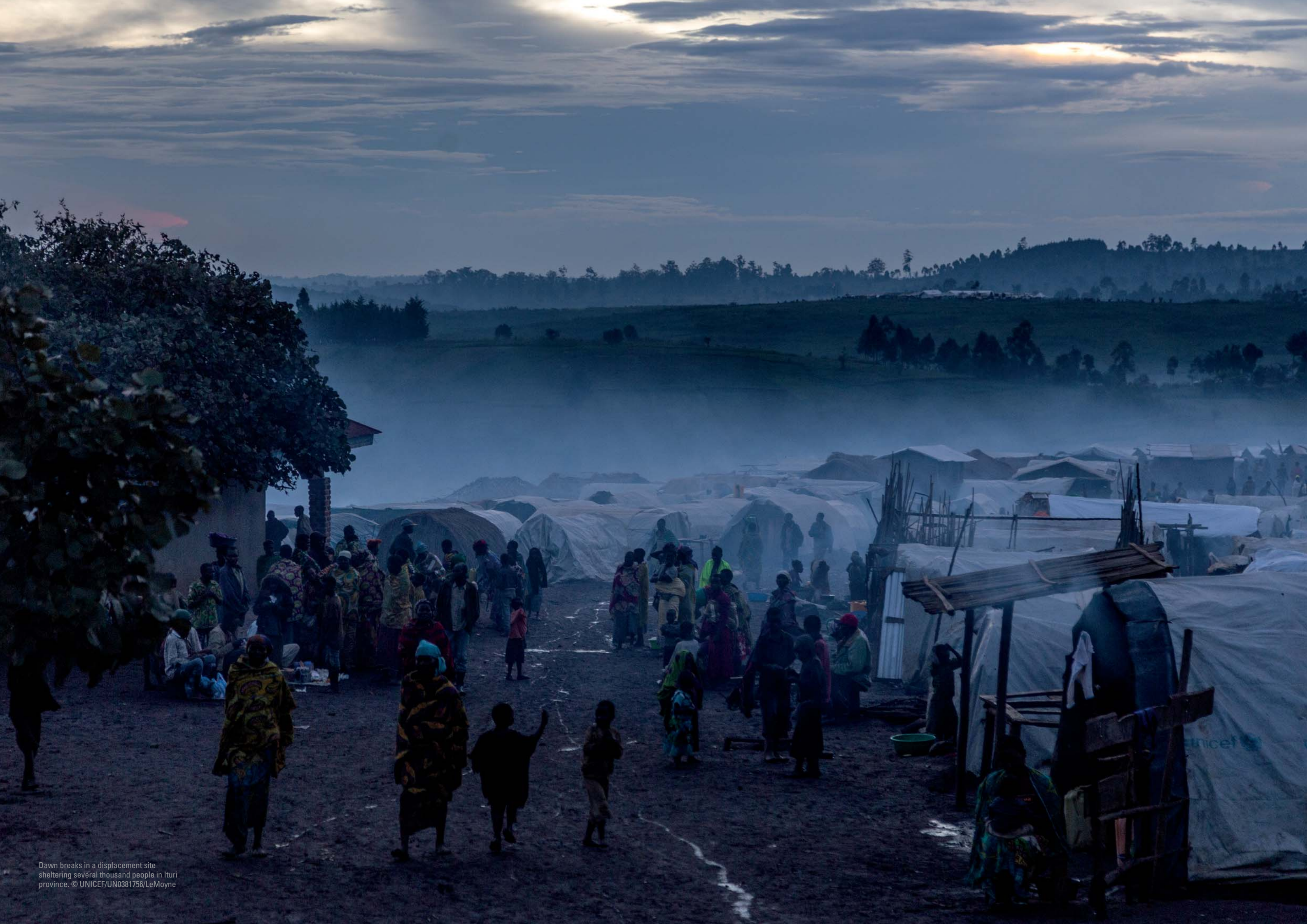
Dawn breaks in a displacement site sheltering several thousand people in Ituri province.