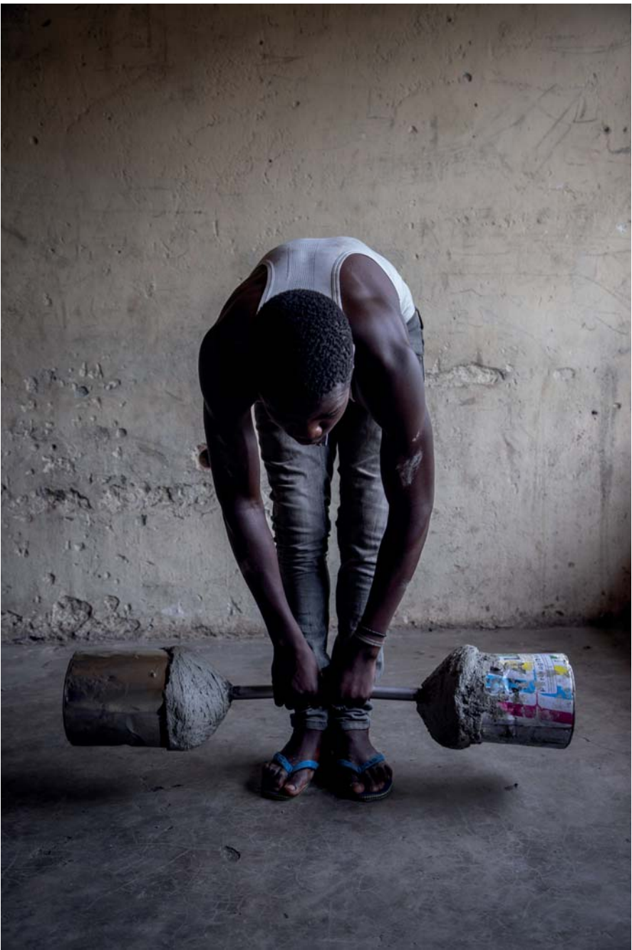
A youth uses a home-made barbell at a rehabilitation centre for former child militia fighters.