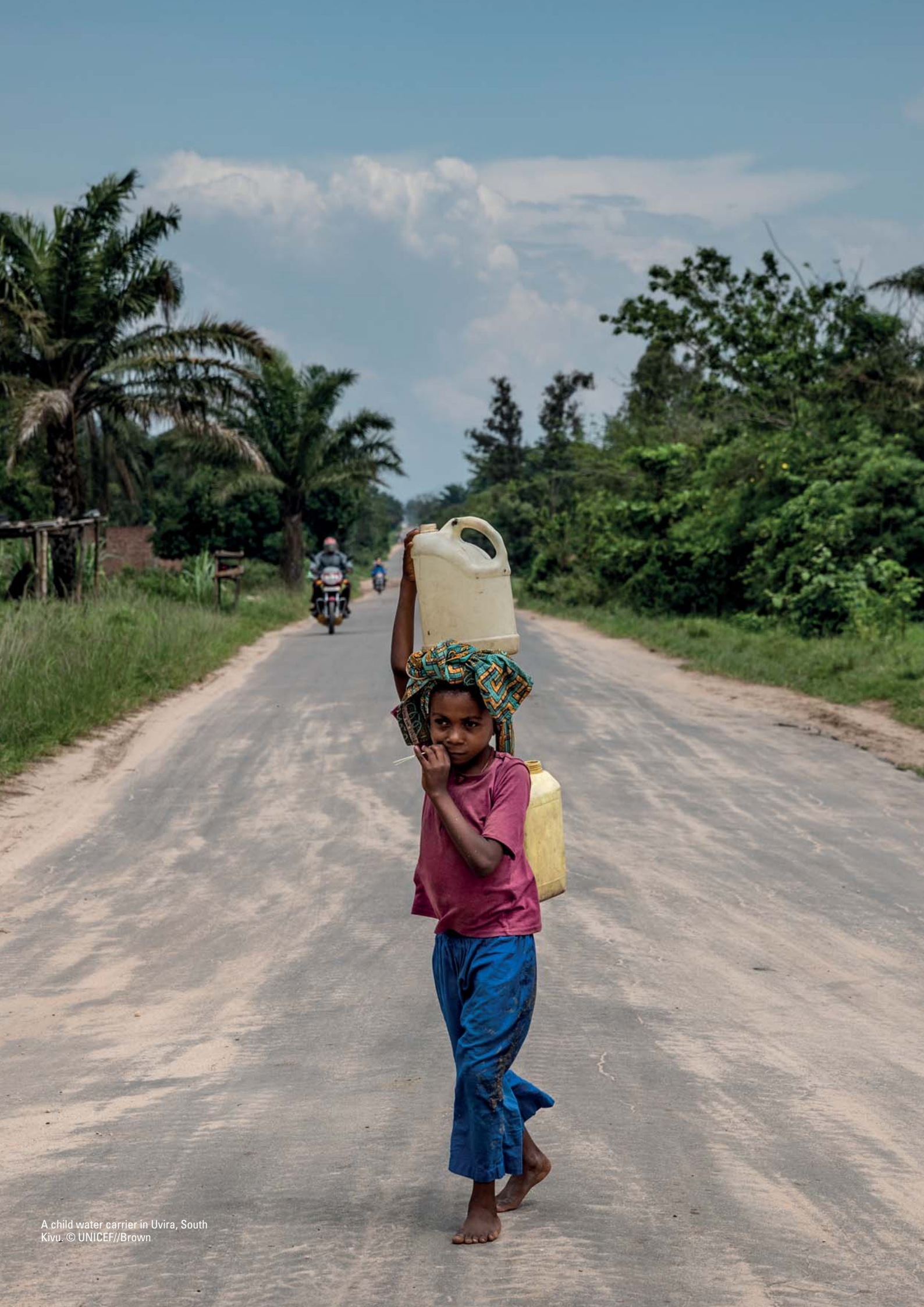
A child water carrier in Uvira, South Kivu.