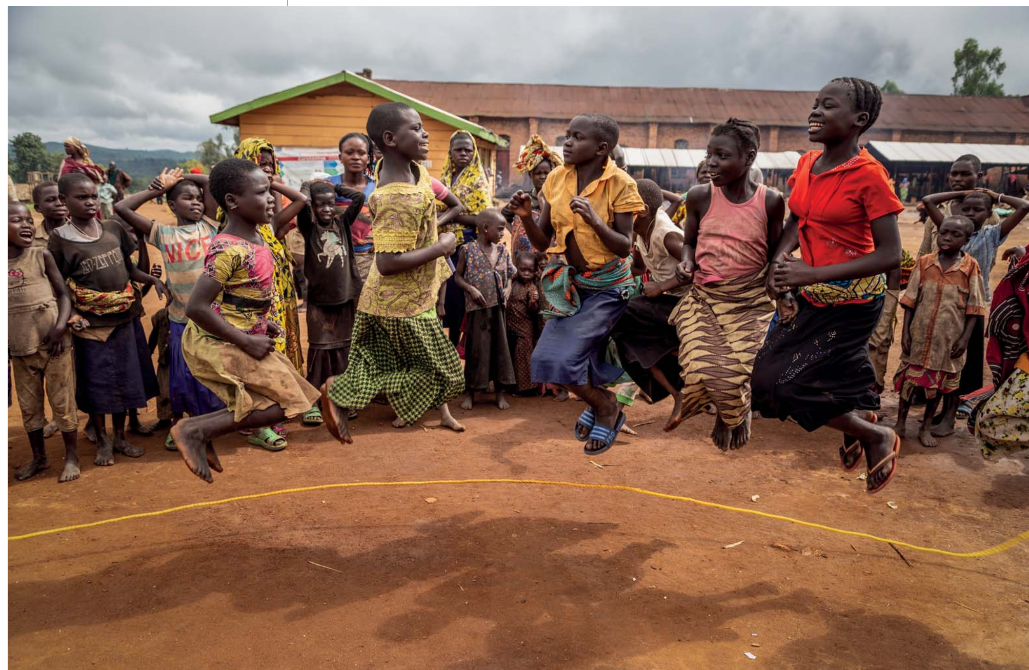
Playtime at a UNICEF-supported child friendly space in Ituri province.

"Homes have been burnt in their majority, crops pillaged, cattle stolen and whatever basic social infrastructures existed destroyed," the report stated. Living conditions in the large camps in the area were inadequate. "Children do not receive education, there are problems with WASH, major protection issues, and in general a sense of people living in squalor over the years."