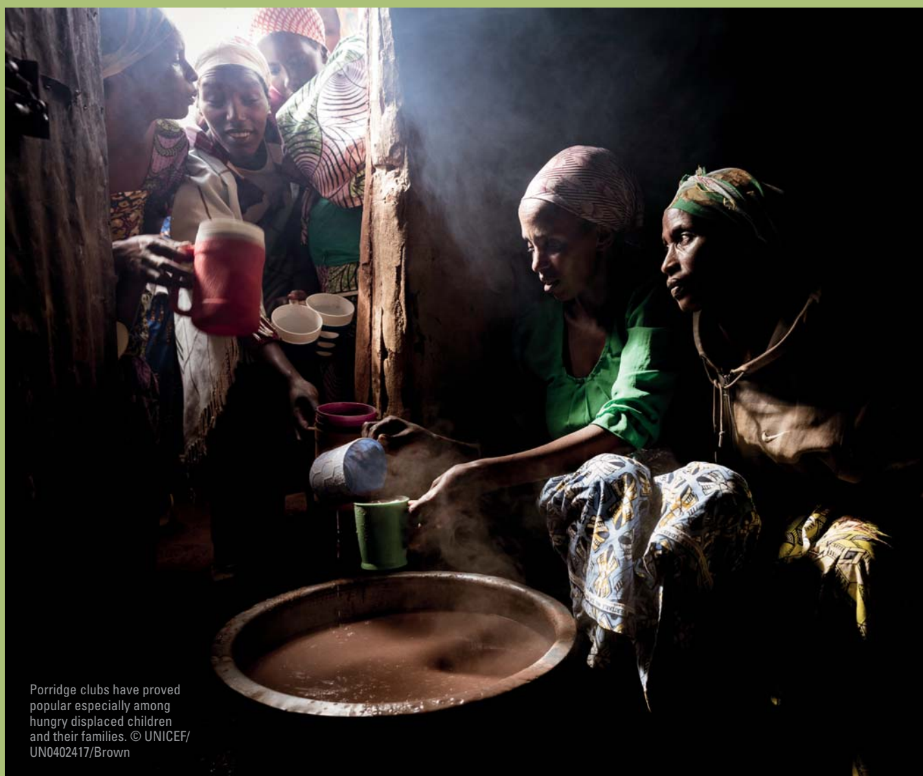
Porridge clubs have proved popular especially among hungry displaced children and their families.