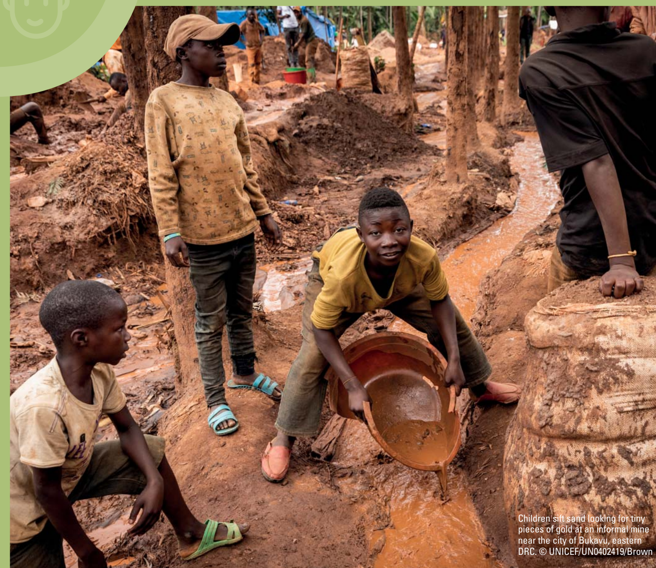
Children sift sand looking for tiny pieces of gold at an informal mine near the city of Bukavu, eastern DRC.