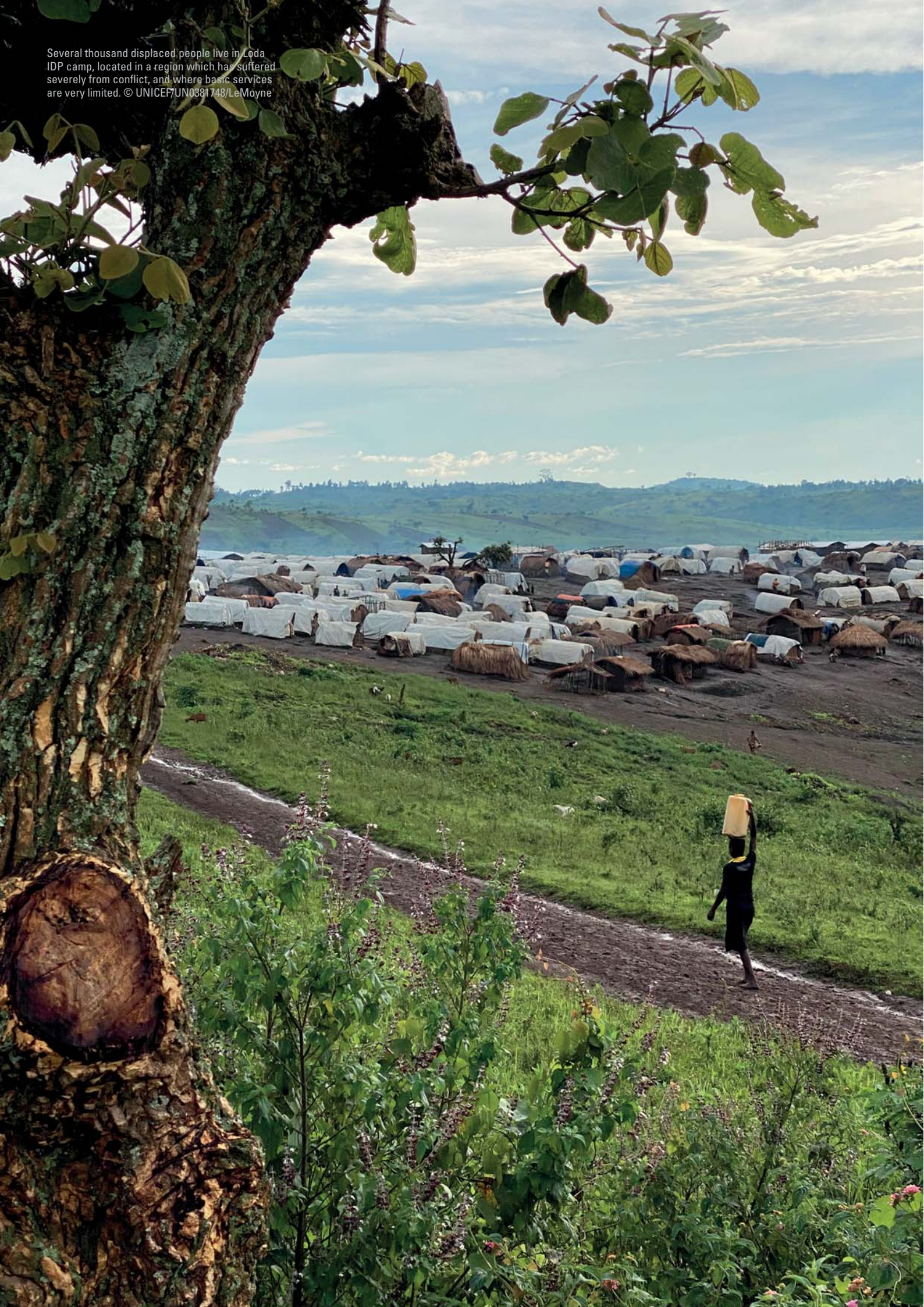
Several thousand displaced people live in Loda IDP camp, located in a region which has suffered severely from conflict, and where basic services are very limited.