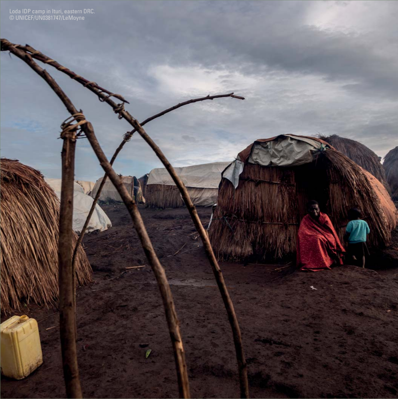
Loda IDP camp in Ituri, eastern DRC.

It is vital that humanitarian efforts are maintained and stepped up, while confronting the challenges of a uniquely complex environment. To that end, UNICEF makes the following Call to Action.