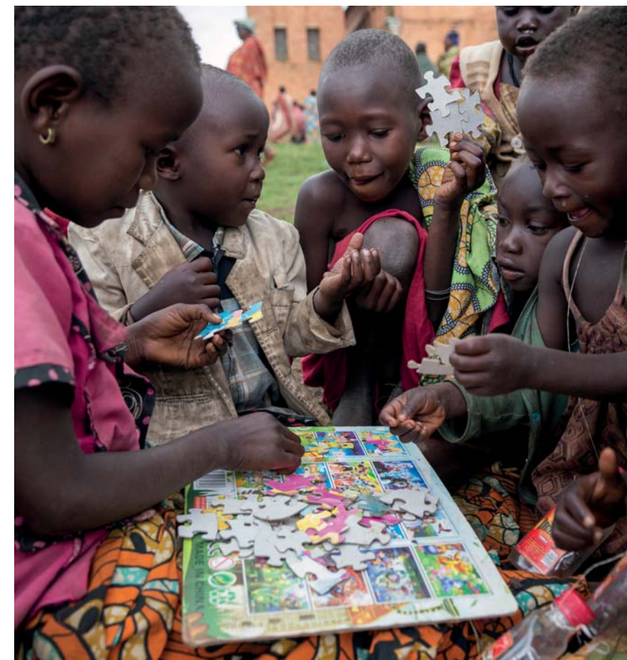
Children play at a child friendly space in a displacement site in Ituri province.

shelters clustered on a hillside below a disused Catholic church.