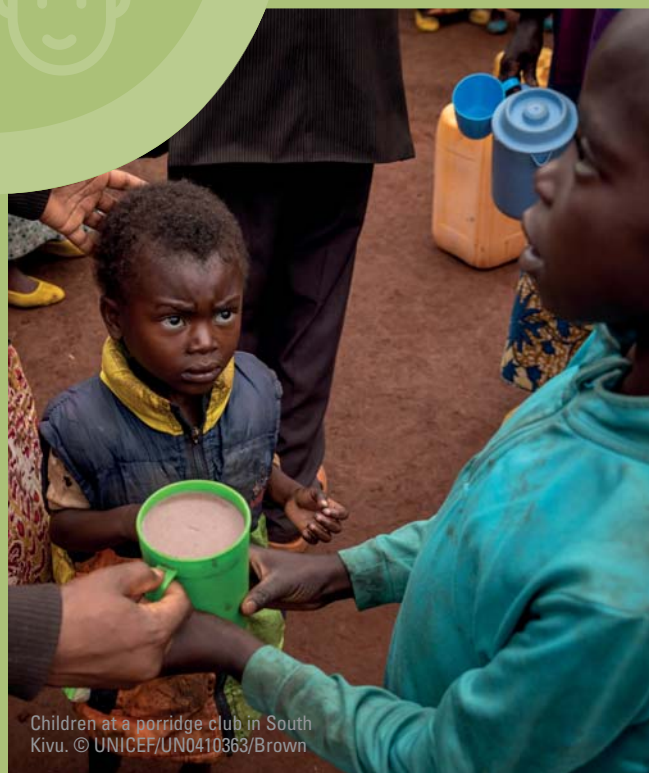
Children at a porridge club in South Kivu.