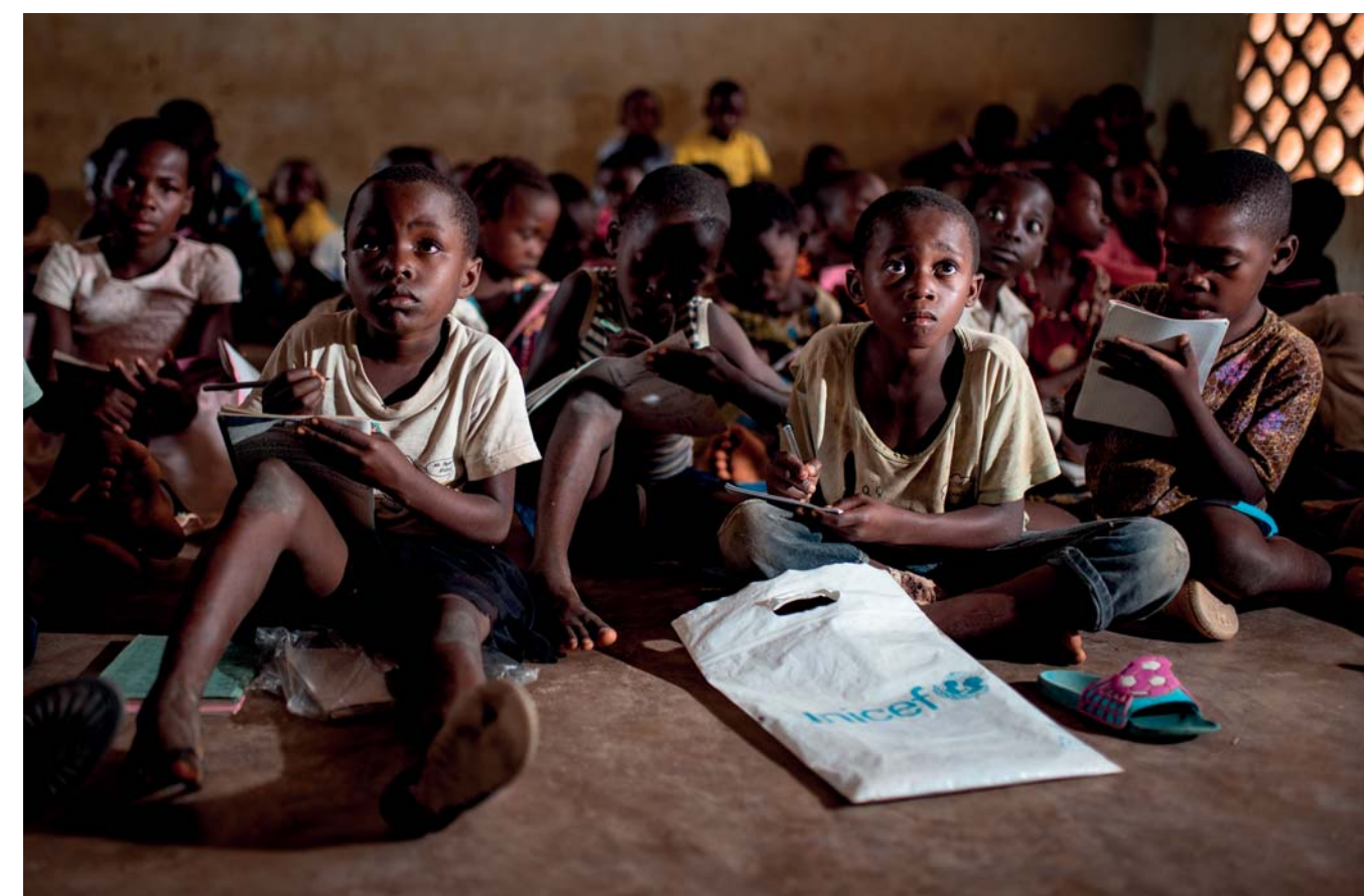
Children at a catch up French class in Mapendano primary school, Nyunzu.

Ethnic conflict has taken a heavy toll on children’s hopes of gaining an education.