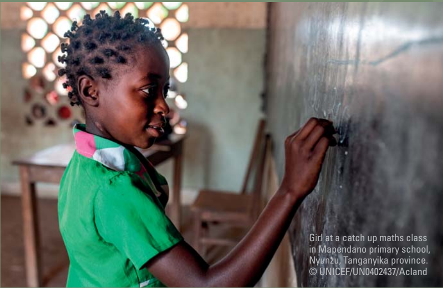
Girl at a catch up maths class in Mapendano primary school, Nyunzu, Tanganyika province.

UNICEF has been active in the DRC since 1963. We reiterate our commitment to realizing these critically important priorities and to working in partnership with the Government of the DRC and civil society partners to achieve common goals for children, women and vulnerable groups – regardless of ethnicity, religion or any other status.