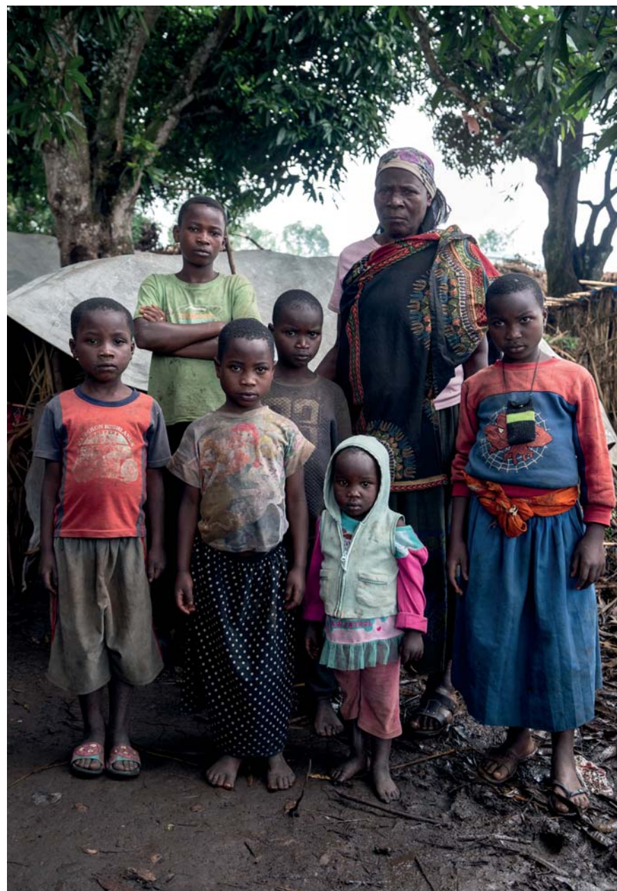
Ferceta cares for six orphaned or unaccompanied children.

church courtyard. These CFS are often used by UNICEF and other agencies during emergencies, allowing children to gather and play in a safe and supervised setting.