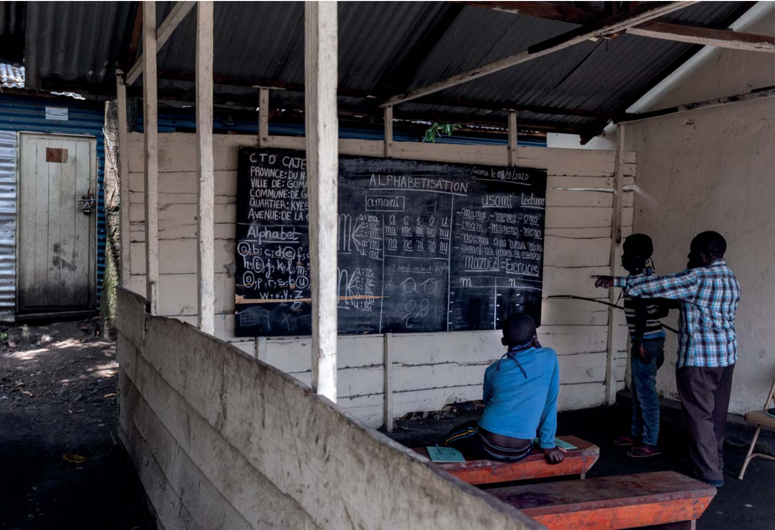
▼ Remedial learning for boys at a centre for separated children in Goma, North Kivu