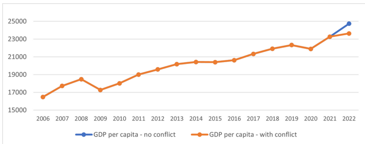
Figure 1: Trend in GDP per capita (PPP) in ECA - 2006-2022

Source: Authors' computations based on IMF World Economic Outlook for October 2021 and April 2022.