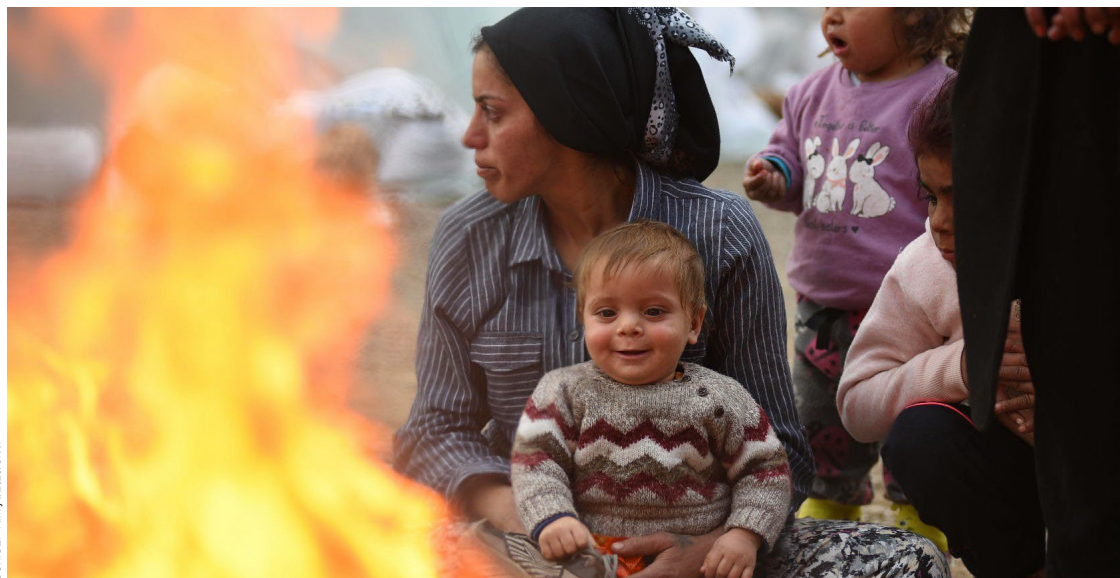
A boy warms himself by a fire in a tented, temporary shelter in south-east Türkiye. After the earthquake, UNICEF is providing winter clothes and essential supplies for affected children and families.