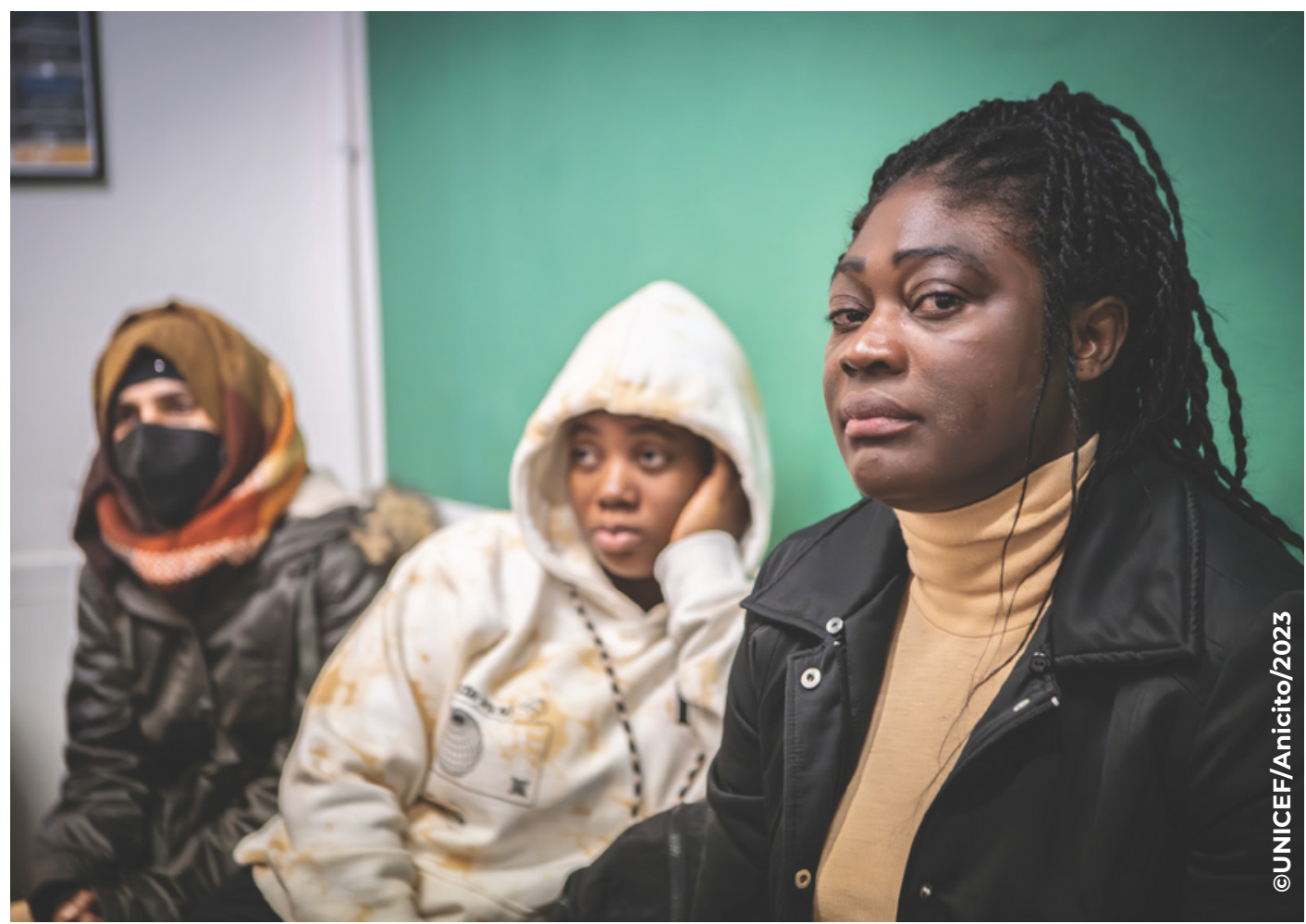
PHOTO 2: Women gathered during activities in the Women and Girls Safe Space of Parma

Despite the Italian government's efforts to cope with the increase in numbers recorded in 2023, including - on 11 April last year - the declaration of a "state of emergency due to the exceptional increase in migrant flows entering the country via the Mediterranean migration routes"3, gaps in the reception system remain. While this measure has made it possible to speed up transfers from the Lampedusa hotspot, it has also led to overcrowding - during the peak summer arrivals period - in the emergency and first reception facilities4 in Sicily, Calabria and Apulia, which are not designed or equipped for long-term reception. On the other hand, there are not enough secondary reception facilities for children, especially for the under-14s, to cope with this influx. In this context, it is necessary to ensure minimum standards of protection and access to essential services , as well as to prevent Unaccompanied and Separated Children from ending up in age- and gender-mixed facilities where there is an increased risk of exposure to violence, exploitation and abuse , particularly in the case of unaccompanied foreign women and girls .