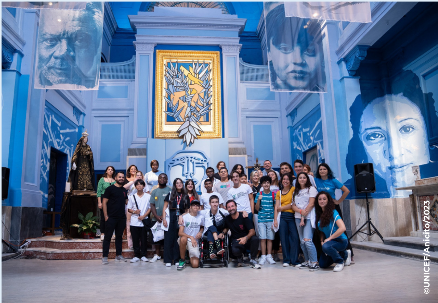
PHOTO 11: The Youth Advisory Board during one of the meetings in Naples

The first episode is dedicated to open schools, the second to mental health and psychosocial well-being, and the third to youth centres as places of encounter and growth. More at https://www.unicef.it/media/yabpodcast/