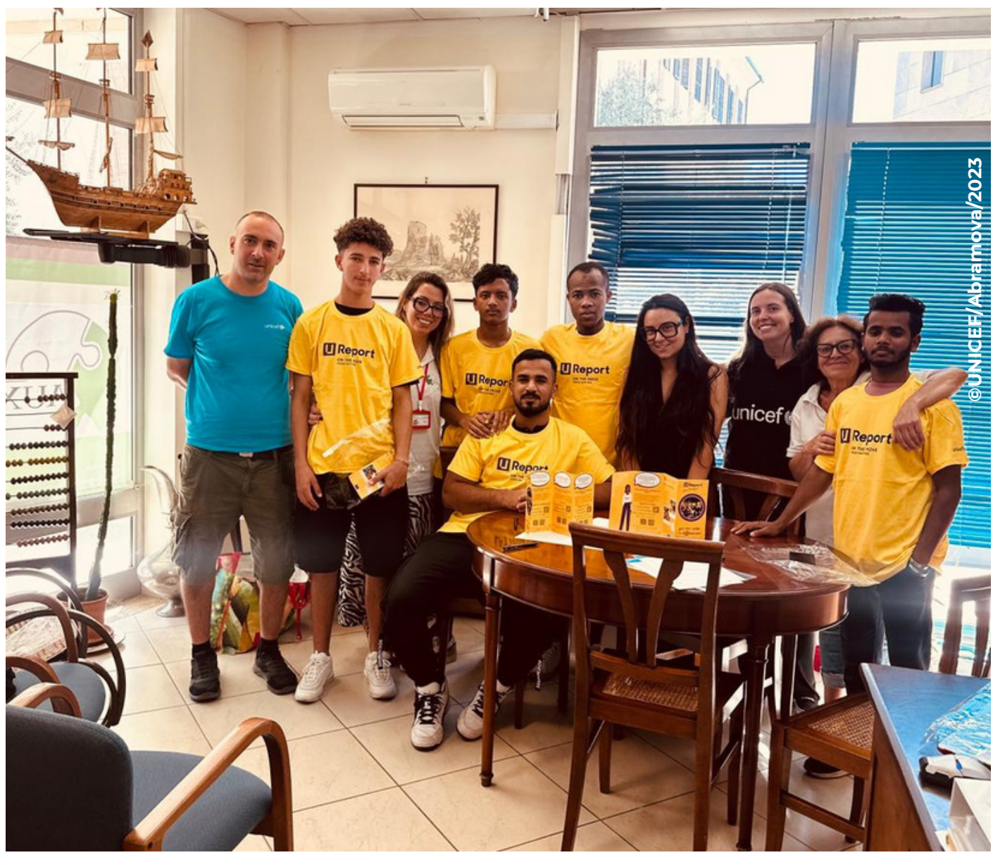
PHOTO 7: A break during the mobilisation sessions of U-Report On The Move

* Data not included in the total because it covers a wider target