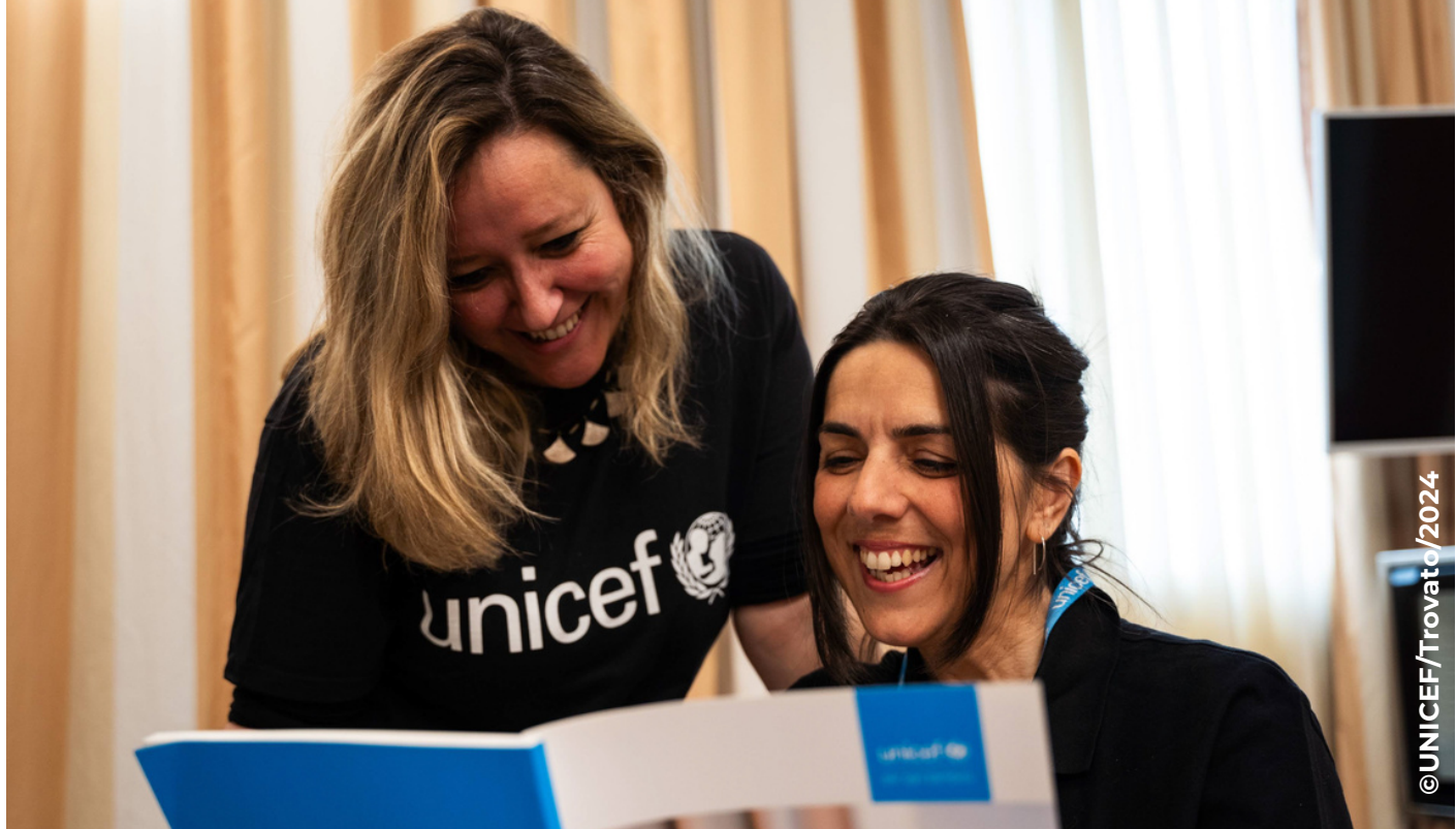
PHOTO 13: A moment of reflection on good practices in psychosocial support for adolescents and young refugees and migrants

The Italian Committee for UNICEF Fondazione Onlus , with the support of the Provincial and Regional Committees, launched and carried out awareness-raising, communication and advocacy activities. The actions in 2023 were implemented thanks to the collaboration with several partners, including AIPI Cooperativa Sociale, Approdi, Arci APS, Arciragazzi, Borgo Ragazzi Don Bosco, Centro PENC, Coordinazione Nazionale Comunità d'Accoglienza (CNCA), INTERSOS, Fondazione ISMU (Initiatives and Studies on Multiethnicity), Junior Achievement (JA) Italia, Refugees Welcome Italia, Save the Children Italia ETS. Among the collaborators, we would like to thank the Association of Foreign Press, CLEDU (Legal Clinic for Human Rights), the Italian National Press Federation (FNSI), the International Rescue Committee Italy, the European Institute of Design (IED), PeoplePub, Saint Louise College of Music, ScuolaZoo, Terres des Hommes, Tree-Opinno, the University of Palermo, the University of Washington in Saint Louise, Younicef, Federped, Cnoas, Cnop, Media: ANSA, Radio Play.