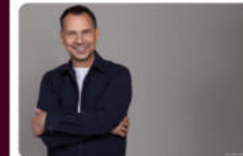
Sebastian Fitzek