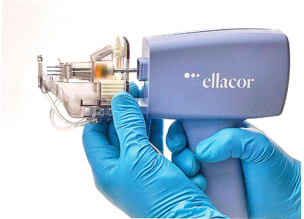
The Ellacor device, which uses hollow needles to remove micro-cores of skin.