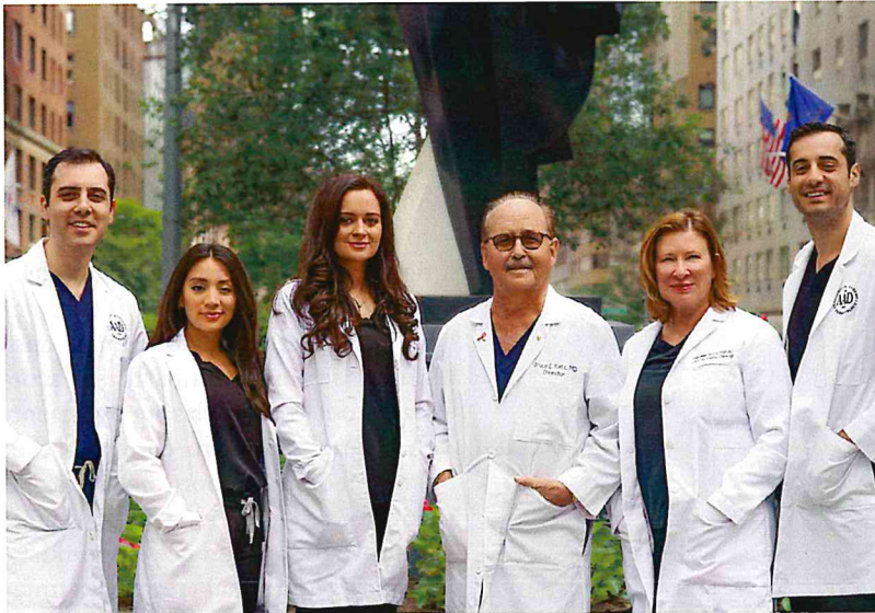
The team behind JUVA Skin & Laser Center, a premier center for cosmetic and medical dermatology located in Midtown, Manhattan.

old I looked, and cut the evening short and didn't call me back." She continued: "After the procedure, I happened to bump into him at a restaurant, and he came up to me and said, 'Wow... you look really familiar, but I can't place you.' He completely did not recognize me. We started dating shortly after. I never told him we had met before."