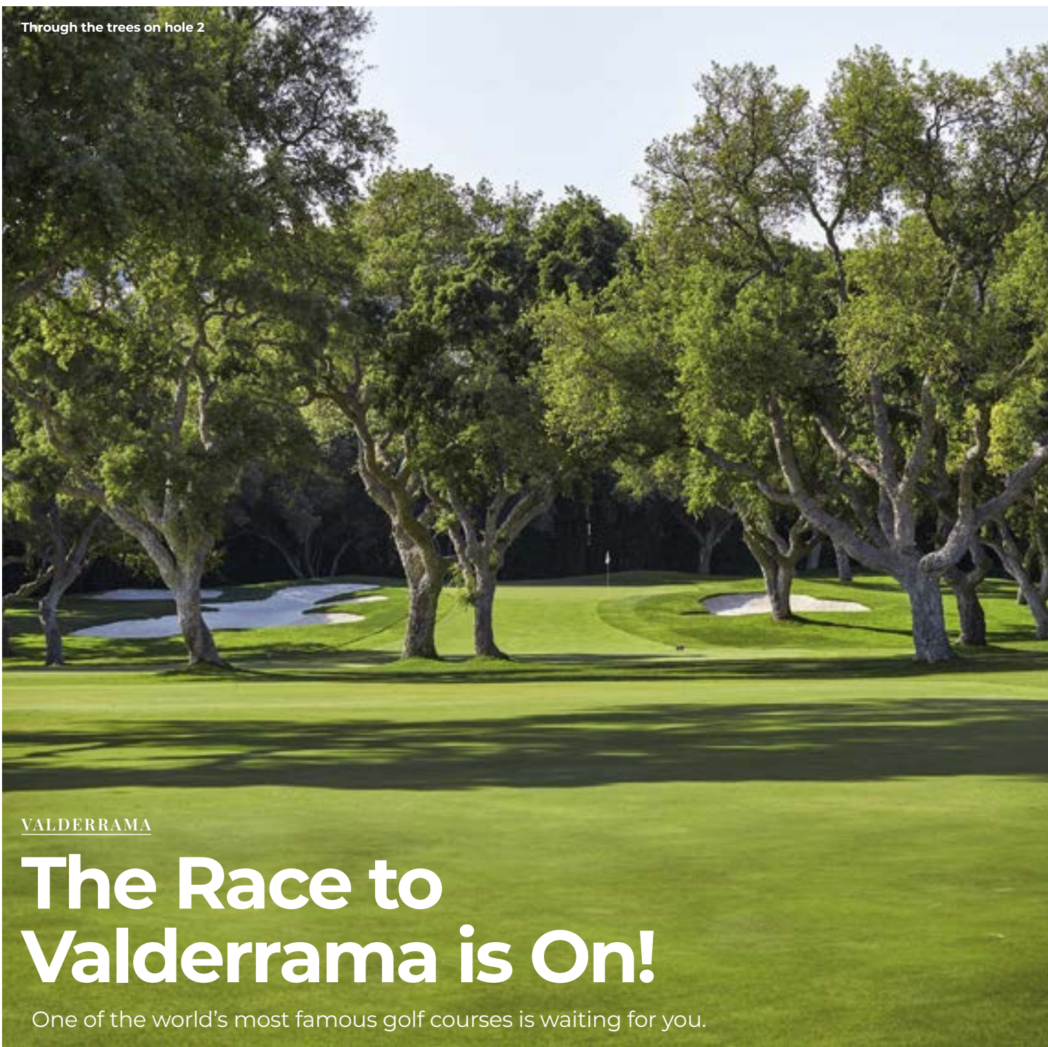
Through the trees on hole 2