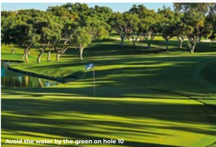
Avoid the water by the green on hole 10

Once you've gathered your team of four and determined which of the qualifying competitions you'd like to play in, you can enter via Macdonald's booking system, BRS.