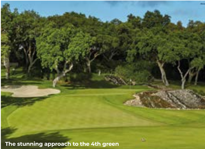
The stunning approach to the 4th green