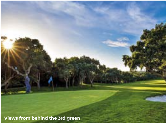
Views from behind the 3rd green