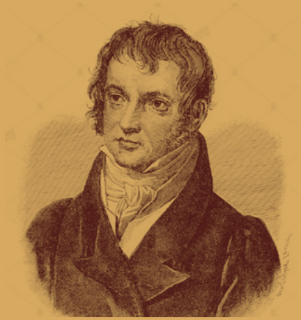
Giovan Battista Niccolini (1782-1861)

The tomb of Giovan Battista Niccolini , poet and playwright of the Risorgimento era, is probably the most recognizable monument to visitors of Santa Croce because it so convincingly recalls a true American symbol , the Statue of Liberty .