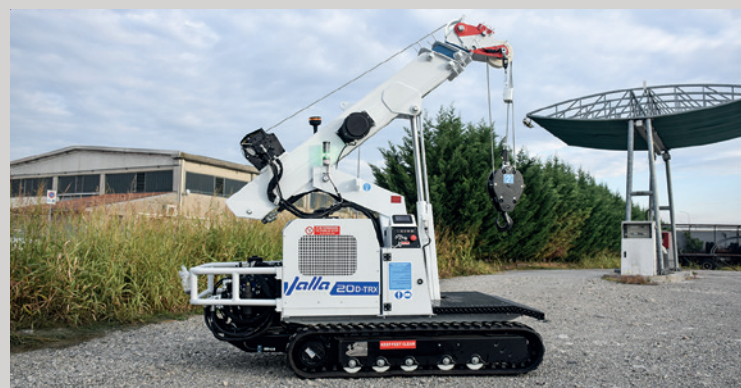
Hydraulic winch & hook block (optional)

Product specifications are subject to change without prior notice or obligation. The photographs and/or drawings in this document are for illustrative purposes only