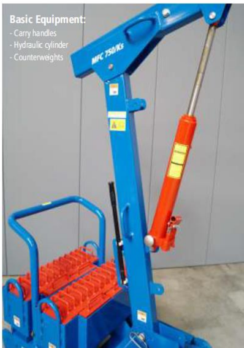
Basic Equipment: - Carry handles - Hydraulic cylinder - Counterweights