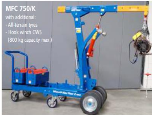
MFC 750/K with additional: - All-terrain tyres - Hook winch CWS (800 kg capacity max.)