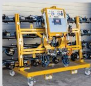
A transport stand is provided for the safe keeping of the DSH-2 Curved