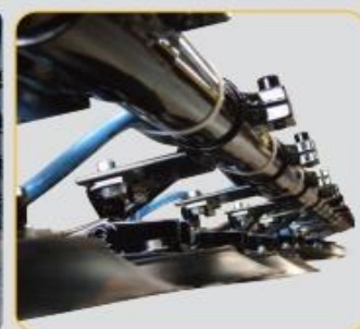
Flexible pads and swivel arms to attach to convex loads