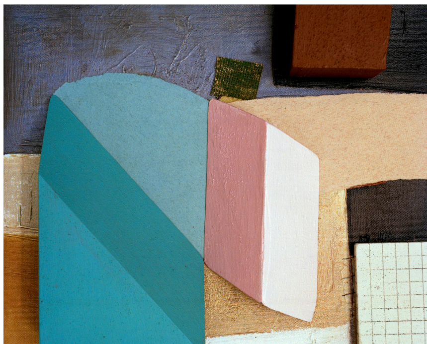
Ali McCann, Suzanne , 2018, Digital Type-C print, 61 x 76.2cm

Oi νεοί , a Greek term meaning ‘the youth’, is a new body of photographic and sculptural work by Melbourne-based artist Ali McCann, expanding upon her exploration of experiential learning, visual perception, and the aesthetics of pedagogy. Through the deconstruction, modification, and assembly of found artworks and teaching materials, these still-life tableaux explore Modernist pictorial strategies and 20th Century philosophies of education. This accumulation of figures, geometric forms, and studio detritus functions as an imagined archive, the falsified evidence of the artistic processes of a fictitious group of adolescents.