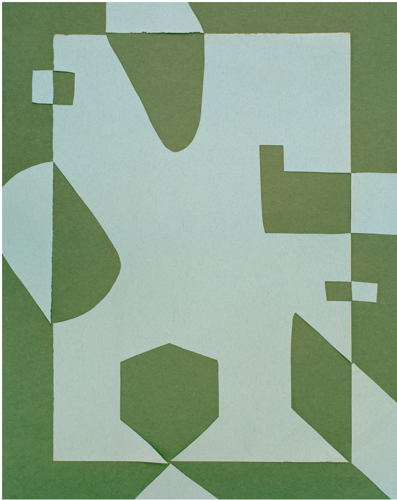
Ali McCann, Counterchange 1 , 2019, Digital Type-C print, 76.2 x 61cm.