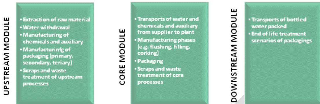
Figure 2 System diagram illustrating the processes that are included in the product system, divided into upstream, core and downstream processes.