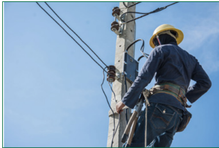
2 to climb – to repair