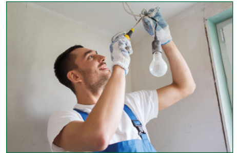
3 to mount