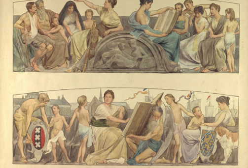
Designs of panel paintings panel by Nicolaas van der Waay 1898.