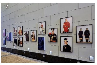
(c) Erwin Olaf, Entourage series (2021) 1st Rijknecht met Rijpaard