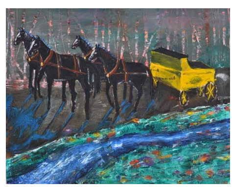
Danielle Hoogendoorn - We are not cattle (2020)