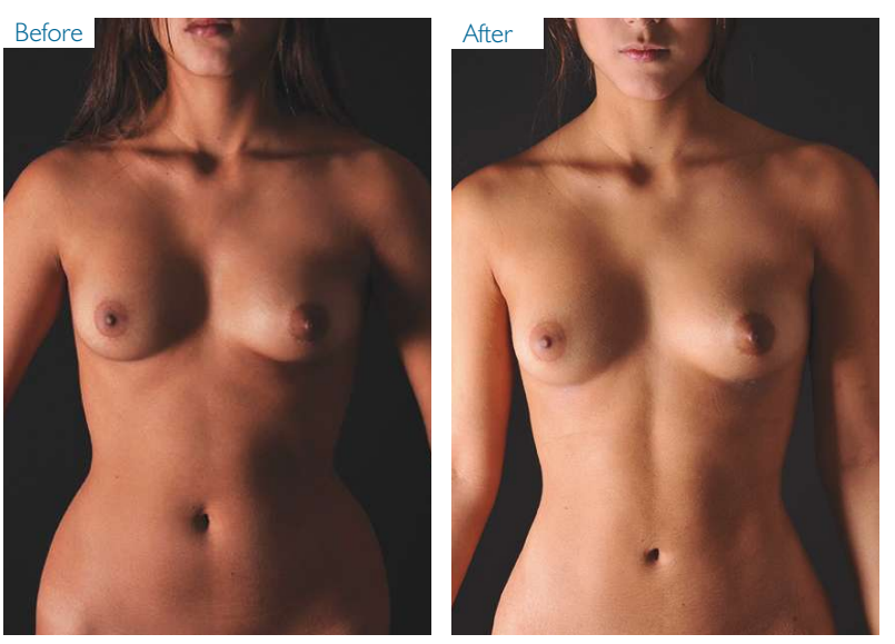
New technologies allow surgeons to fine-tune their results by working in both the deep and superficial layers.

Another way physicians control the outcome of liposuction is in the choices they make regarding anesthesia, aftercare and the surgical