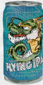
flying ipa echigo

ask a server for our full selection of draft beer