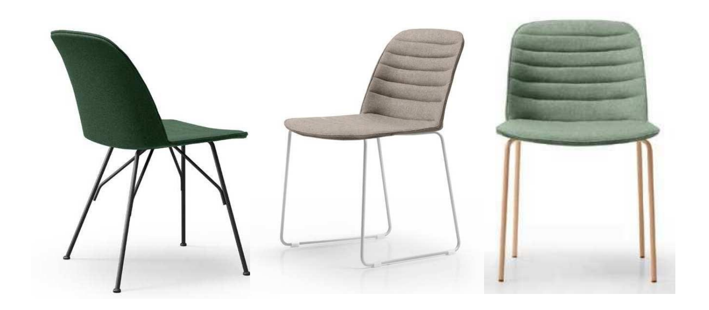
{\tt COVER\_Single\ polypropylene\ shell\ completely\ upholstered}

STRIPES _ Single polypropylene shell completely upholstered