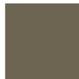
TORTORA RAL 7006