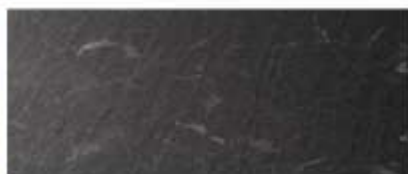
HM NERO EFFETTO MARMO