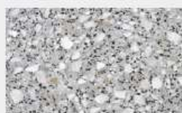
GRIGIO PERLA 172