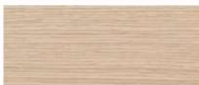
N4 ROVERE NATURALE