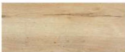
HR ROVERE NATURALE