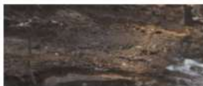
N6 EFFETTO MARMO