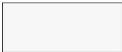
HB BIANCO / NERO