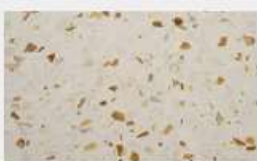
CA D'OR 140