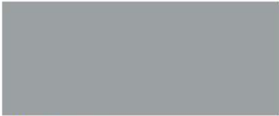
V4 MORNING (MATT)

The metal is painted with epoxy powders in white or black colors or in the colors: