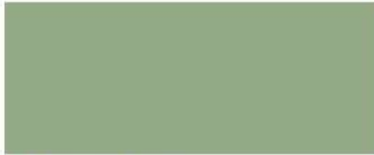
V08 VERDE SALVIA (MATT)