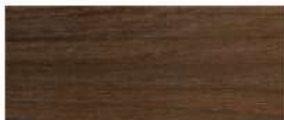
N2 MOKA LARIX