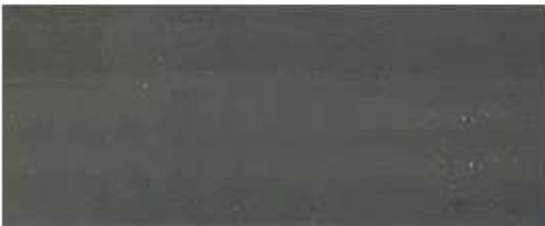
V0 FERRO TRASPARENTE (MATT)