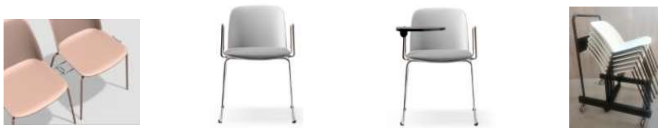
Folding union hook