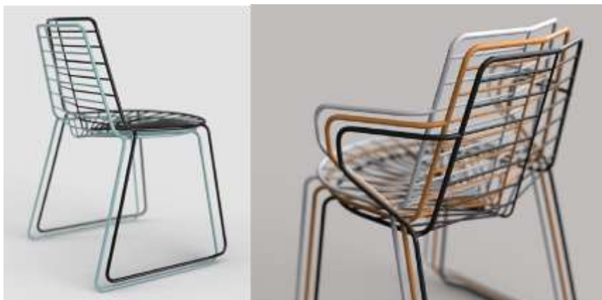
2. Armchair with slide rod frame with armrests

The armchairs can be stacked either in the version without armrests or in the version with armrests