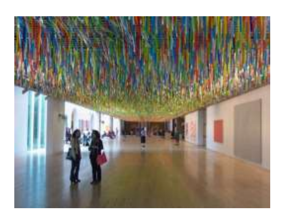
Nike Savvas Rally (2014)