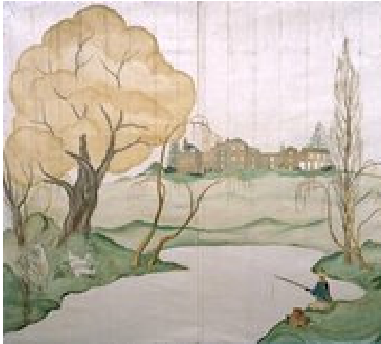
Roy De Maistre House and fisherman, woodland and deer, lake (early 1930's)