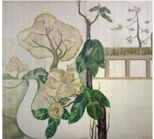
Roy De Maistre Magnolia and path (early 1930's)