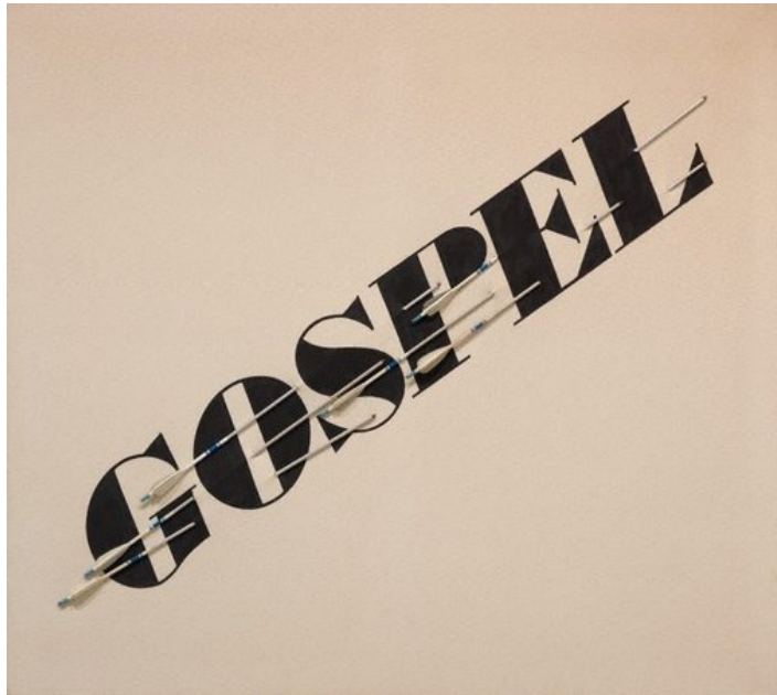
Edward Ruscha Gospel (1972)