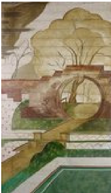
Roy De Maistre Moon Gate Garden (early 1930's)