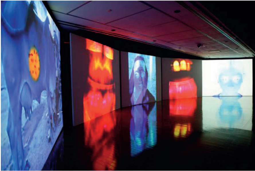
Nalini Malani (India 1946 -) Mother India: transactions in the construction of pain 2005, video play; five video projectors in sync, sound, 5 minutes, dimensions variable. Purchased with funds provided by the Art Gallery Society of New South Wales Contempo Group 2011