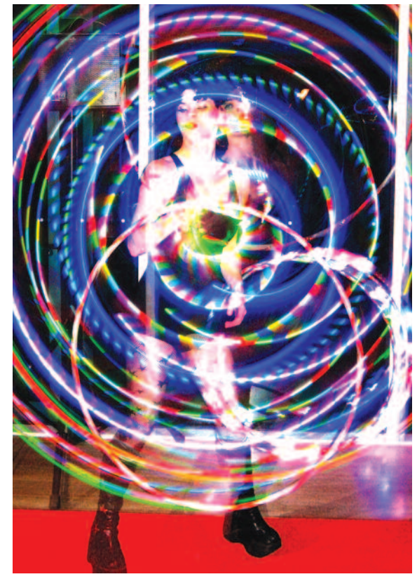
Contempo party.