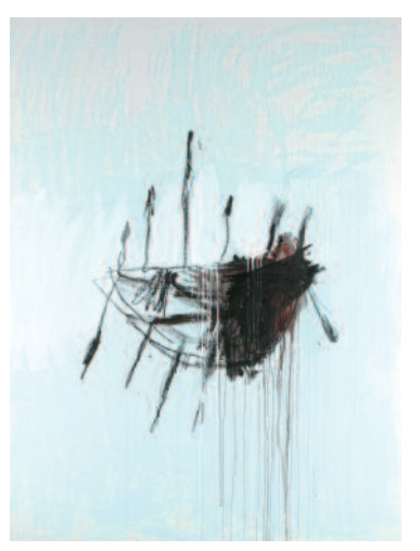
Cy Twombly Three Studies from the Temeraire