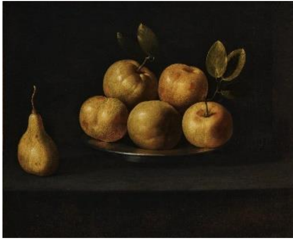
Francisco de Zubaran Still Life with Apples on a Pewter Plate and a Pear c1641, purchased with support of the Art Gallery Society of New South Wales