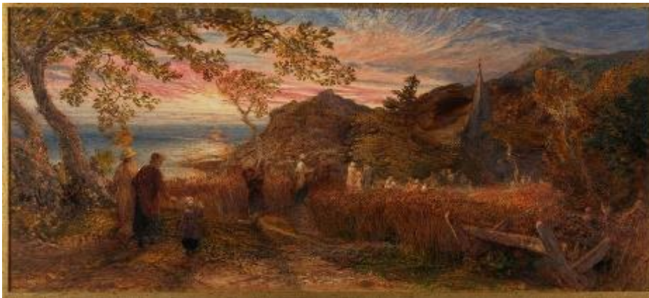
Samuel Palmer Going to Evening Church 1874, purchased with support of the Art Gallery Society of New South Wales