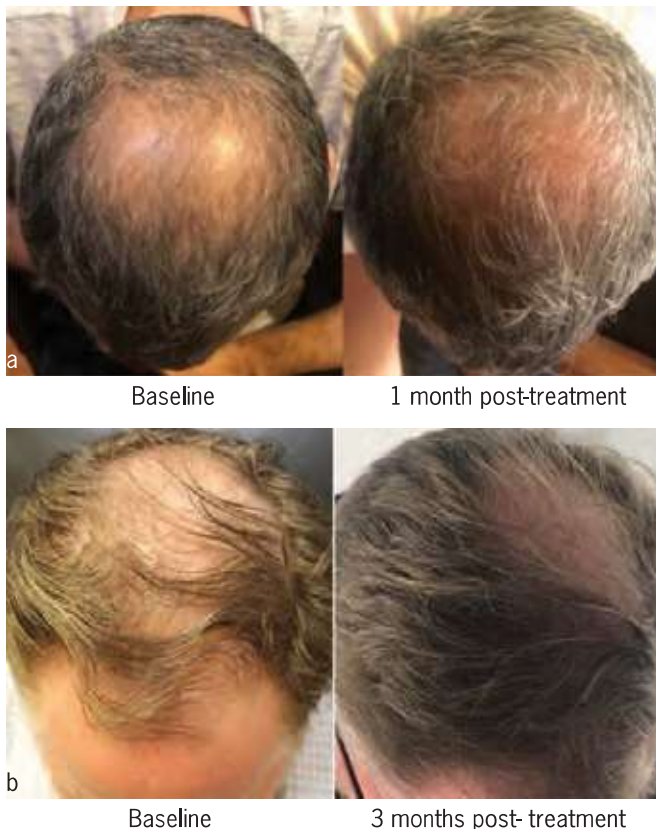
Figure 1. Effect of exosome treatment on hair restoration. Photographs of two patients at start of treatment and (a) 1 month and (b) 3 months after treatment with a single injection of exosomes. 8

Although mostly anecdotal to date, exosome therapy has shown promising results in humans as well. The most enticing result reported by hair restoration surgeons is visible hair growth much earlier than conventional nonsurgical therapies (Figure 1). Even so, using our search criteria, we only found one article in which the effects of exosomes on hair restoration in humans were evaluated. In this study, hair density and thickness were measured at start of treatment and 12 weeks after exosome treatment in 20 patients with AGA. The researchers reported that exosome therapy increased mean hair density from 105.5 to 122.7 hairs/cm 2 ( P < 0.001 ) and mean hair thickness from 57.5 to 64.0 \mu\text{m} ( P < 0.001 ) from baseline to assessment at week 12, respectively. 31 The researchers also stated that patients reported no serious adverse events. A number of other studies have shown similar effects in AGA patients treated with media conditioned by adipose-derived stem cells; however, whether these effects are due to the presence of exosomes in the conditioned media is not known. 32–35