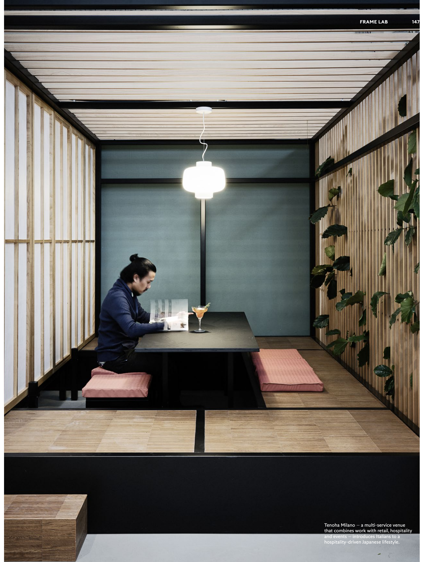
Tenoha Milano – a multi-service venue that combines work with retail, hospitality and events – introduces Italians to a hospitality-driven Japanese lifestyle.